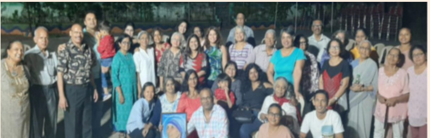
Compiled by Leah n Photos n editing by Wendy Watts ( Zone 1 unit 3 )