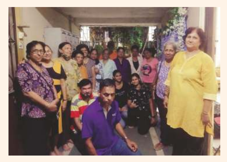
Every year our community conducts the rosary to our Blessed Mother all through the month of May. This