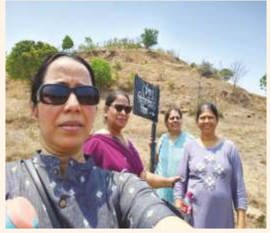
September 2022 - FLOCK NEWS • 15

Flock News (1) Sept 2022 indd 15 06-09-2022 15:03:03