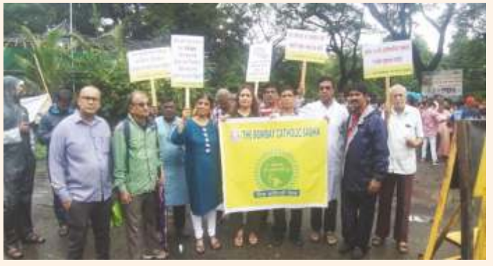
September 2022 - FLOCK NEWS • 9

Flock News (1) Sept 2022.indd 9 06-09-2022 15:03:02