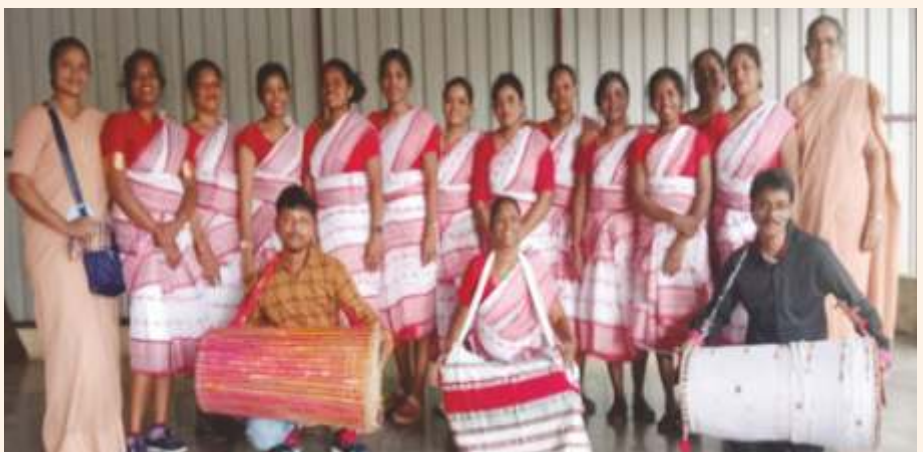
10 • FLOCK NEWS - September 2022

into focus the myriad injustices faced by the migrant population in our country especially in the city of Mumbai. Looking back in hindsight, we now realise how indispensable the migrant workforce is in the development and maintenance of life in our big city. Pope Francis gave us four keywords with respect to migrants and refugees — Welcome, Protect, Promote, Integrate. We must uphold their human rights and dignity and ensure social and economic justice. Keeping this in mind, the AMC collaborated to launch an e-Shram card awareness; conducted a session on "Stress Management Post Covid"; had a Human Rights Day on the topic of "Reducing Inequalities, Advancing Human Rights". There was also a Mass Wedding which was a true celebration of Sacraments of Baptism, Communion, Reconciliation, Confirmation & Matrimony. The harvest or Karam festival was celebrated too and picnics held. Mass is celebrated in Hindi at various units on Sundays followed by an empowerment program. A general census is also being carried out which will assist the Archdiocese in taking a call on certain matters. The Good Shepherd unit has collaborated well with the AMC on various empowerment programs including attending to the spiritual needs of the migrants.