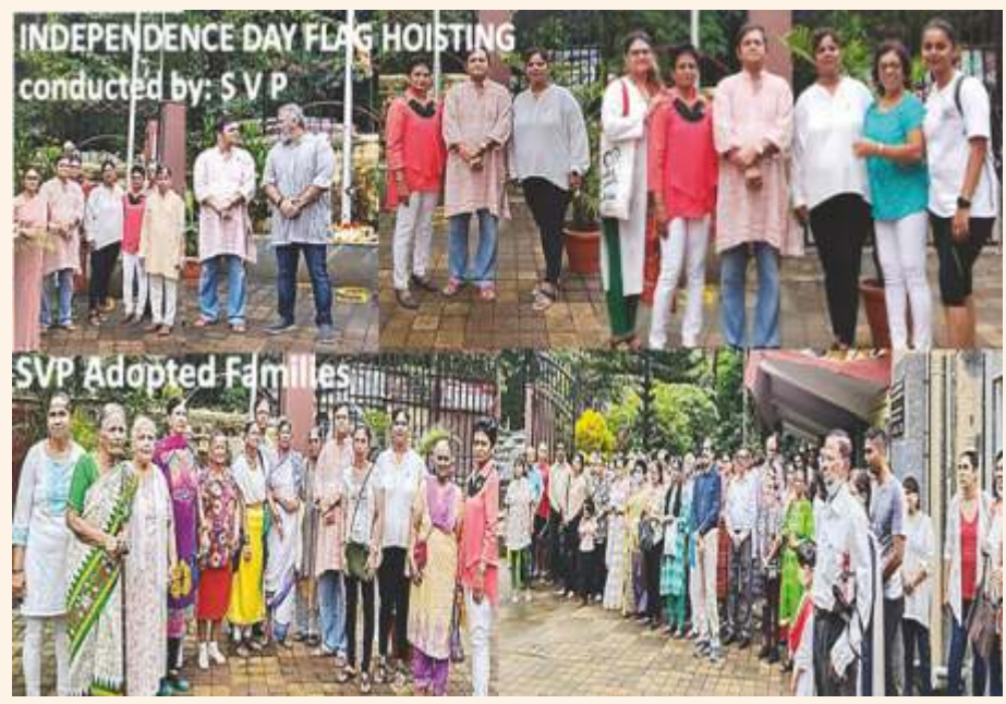
8 • FLOCK NEWS - September 2022

This year, St. Vincent de Paul (SVP) held the Independence Day flagraising ceremony after the 7.00am konkanimass. The SVP's adopted families were also invited. Their faces were lit up with a broad smile. Flag pins were distributed to the parishioners.